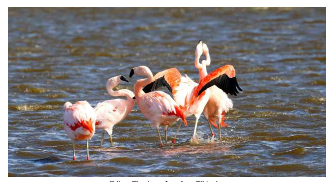
Chilean Flamingos

December 10, Day 9: Trelew, and Flight to Bariloche. We should be able to start the day birding near Trelew, perhaps visiting the sewage lagoons a short distance east of town. These lagoons usually host tens of thousands of waterfowl, and this will be a chance to catch up with any waterfowl we may have missed and to see large numbers of Chilean Flamingos. Two species that could be new to our lists at this point are the White-cheeked Pintail and Andean Duck (most of the Oxyura ducks here are Lake Ducks). Other species, often in large numbers, could include the lovely Silvery and White-tufted grebes, Red Shoveler, Crested Duck, Silver Teal, Kelp and Brown-hooded gulls, and three species of coot.