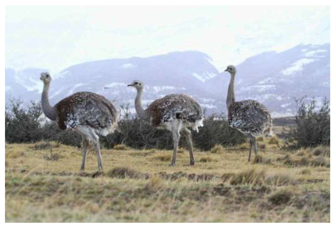
Lesser Rheas

At the top of our wish list here are the Magellanic Plover, stunning Tawny-throated Dotterel, Lesser Rhea, Least Seedsnipe, and the wonderful Chocolate-vented Tyrant. Other fine birds include the Cinerous Harrier, the very local Spectacled Duck, Austral Parakeet, Austral Pygmy Owl, and Lesser Horned Owl. Springtime is an excellent season for botanists, too, and with luck, we may see three or four species of colorful orchids and exotic-looking calceolaria.