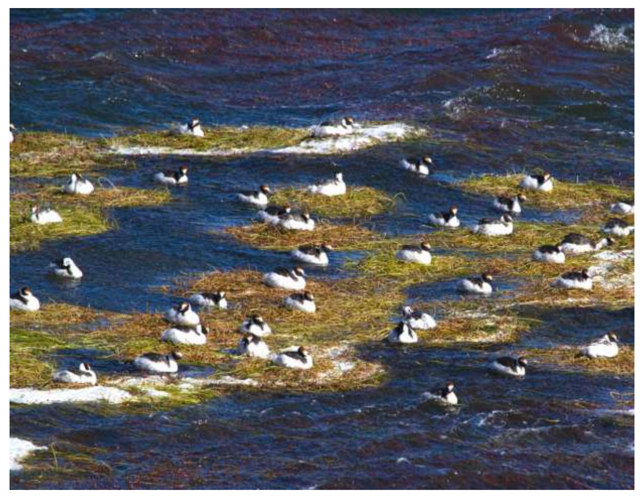
Hooded Grebe colony

December 17, Day 3: Birding en route to Calafate; Afternoon Flight to Buenos Aires. After a great breakfast, we will bird our way through the stark landscapes on the way back to Calafate. Here we will catch an afternoon flight back to bustling Buenos Aires, followed by the transfer to our charming hotel. If timing makes it possible, some of us may connect with international flights back to the US today.