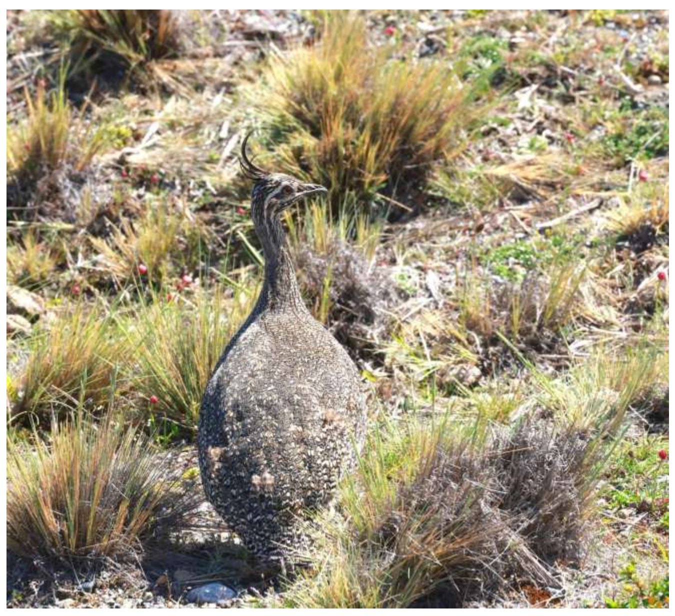
Figure 1Elegant Crested Tinamou