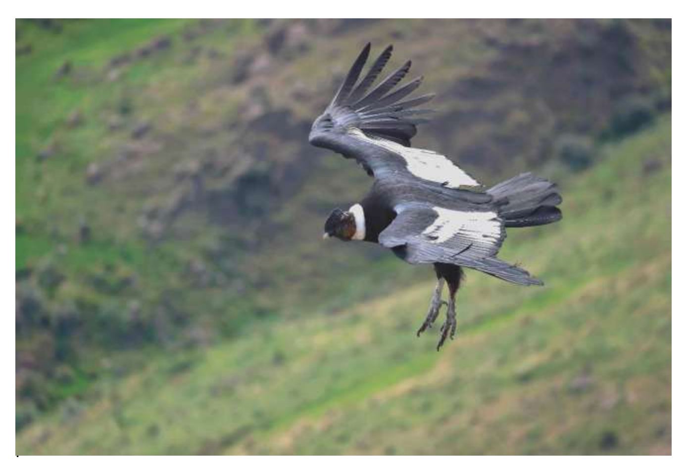
Andean Condor

Least and occasionally Gray-breasted seedsnipes can be found in the beautiful high-country grasslands outside the park. The broad, shallow braided streams often teem with canasteros, ground-tyrants, Patagonian Sierra Finches, and occasionally the rare Great Shrike-Tyrant. At this time of year, many species are beginning to nest, and the songs and displays of many of them can be heard or seen on calm mornings; others may already have young. Thanks to its raw beauty, sweeping vistas, and abundant wildlife, many of us consider the Calafate area one of the highlights of the trip. As a bonus, the accommodations and food at El Calafate are truly excellent.