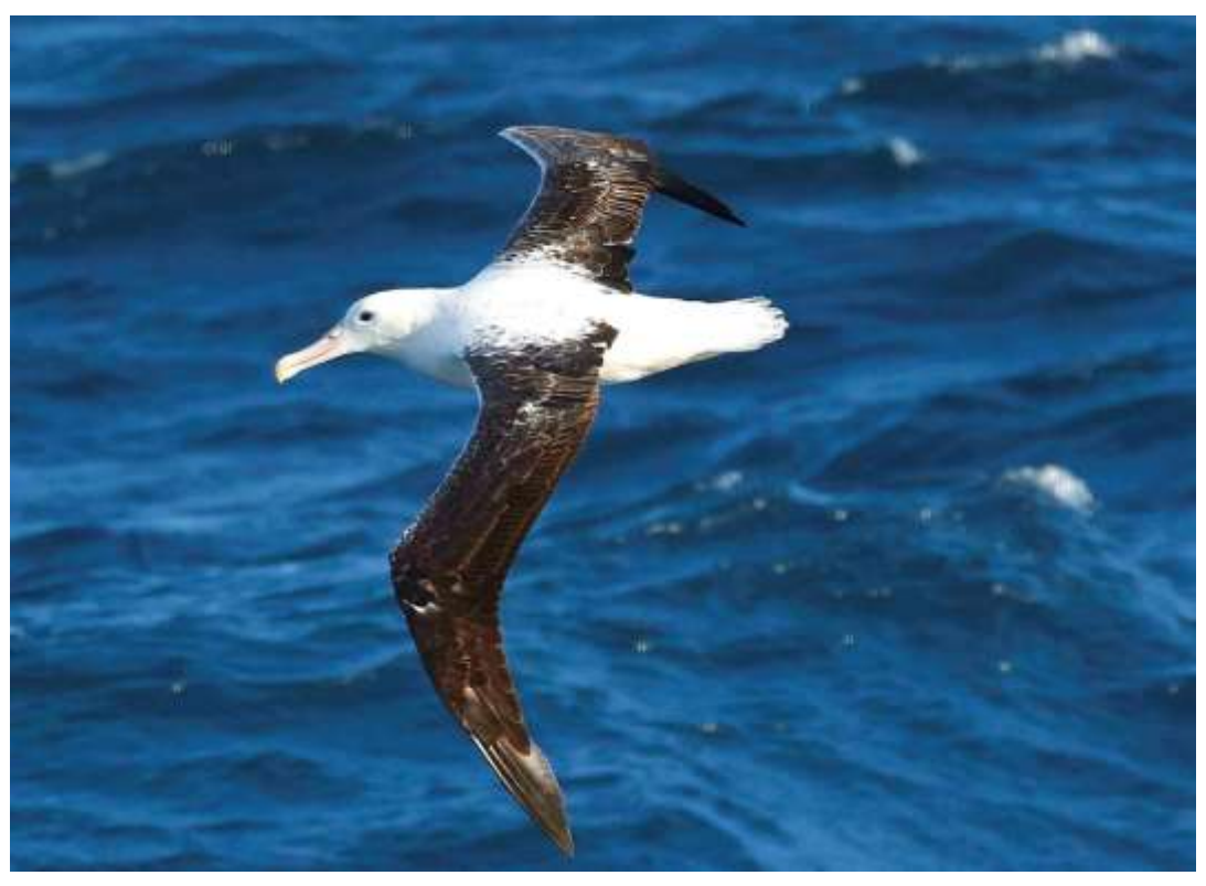
NIGHT: Hotel Costa Galana, Mar Del Plata

Greater, Sooty, and Manx shearwaters; Wilson's Storm-Petrel; Parasitic Jaeger; and Chilean Skua. Spectacled Petrel, Southern Fulmar and Cape Petrel are both rare but possible. Common Dolphins are fairly frequent, and other cetaceans are possible. We will return in time for a late lunch, then have the rest of the day to rest up or to explore the marshes at nearby Reserva Natural del Puerto.