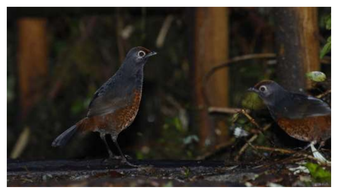
Black-throated Huet-huets

December 13, Day 12: Morning Birding; Flight to El Calafate and Afternoon at Laguna Nimez. Around mid-day, we'll board a flight to El Calafate, in southern Patagonia. After checking into our hotel, we will pay a visit to a nearby lake, with good chances at seeing Andean and Lake ducks, Red Shoveler, Yellow-billed Pintail, Chiloe Wigeon, one or more coot species, and a variety of gulls and shorebirds. Cinereous Harriers and the stunning Chocolate-vented Tyrant are here, too, and the Austral Negrito is ubiquitous. Our main goal is the highly sought-after and very locally distributed Magellanic Plover. Found only on remote pebble-lined lakeshores, this shorebird is so unusual in so many ways that it is classified in its own family, Pluvianellidae, said to be most closely related to the sheathbills. This bird's curious behavior at time resembles a turnstone's, but then it stomps circles in the mud and pecks at the food it has stirred up. Magellanic Plovers feed their young on crop milk not unlike that secreted by doves.