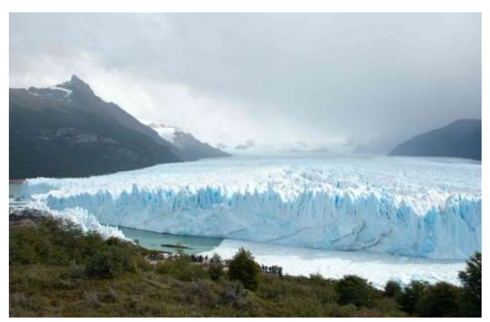
Perito Moreno Glacier

A flight to El Calafate takes us to the edge of the Southern Patagonian Ice Field. Charming El Calafate is the gateway to Los Glaciares National Park and the massive Perito Moreno Glacier. A springtime visits to this ever-shifting icy landscape will make an absolutely unforgettable impression on anyone fortunate enough to visit at this delightful season.