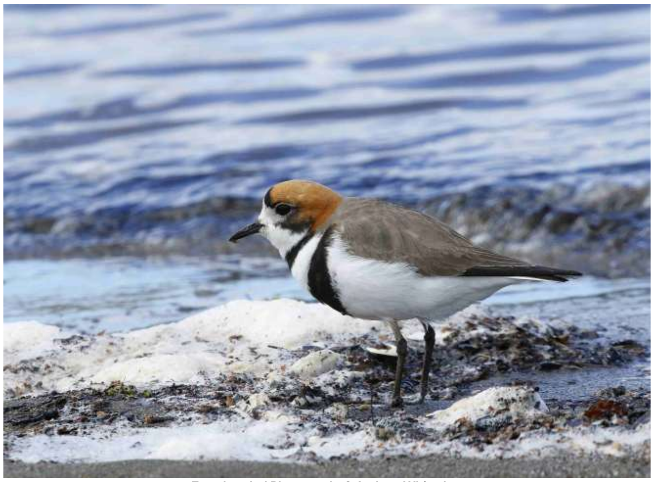
Two- banded Plover male

December 8, Day 7: The Valdes Peninsula. The wildlife of the Valdes Peninsula is perhaps the most unusual, and in many ways least familiar, of any regional fauna in Argentina. This is a fairly reliable wintering site for the Snowy Sheathbill; though most of them have already migrated south at this point, if we are lucky, there may still be one or two lingering with the cormorants, terns, and oystercatchers. In the arid landscapes of scrub and grassland, we will look for the endemic Rusty-backed Monjita and Patagonian Canastero. The coast itself has thriving colonies of marine mammals and birds. Other cool birds here may include the Variable Hawk, Plain-mantled Tit-Spinetail, Austral Negrito, Short-billed Pipit, and the near-endemic Patagonian Yellow-Finch; there are often a few surprises as well.