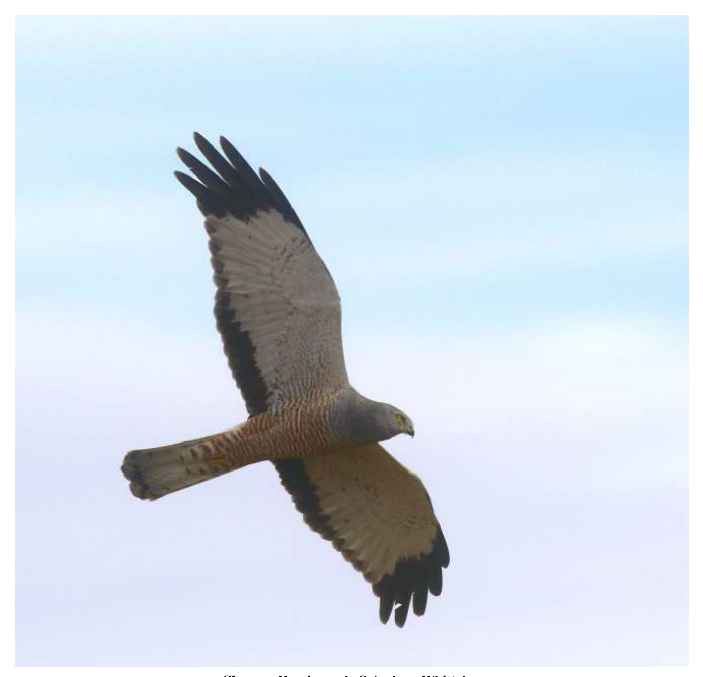
Cinerous Harrier male

This extension is also a unique opportunity to see just how an immense and remote comfortable estancia functions along with enjoying the majestic stark Patagonian wilderness.