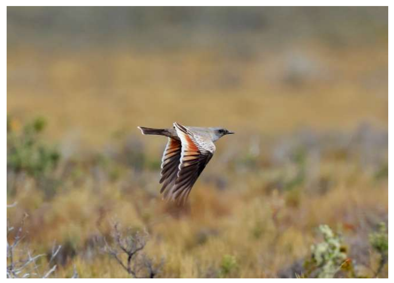
Chocolate-vented Tyrant

We will return to our hotel in time to pack for our flight back to Buenos Aires, where those not continuing on the extension will connect with international flights; if you would rather overnight in Buenos Aires instead, the VENT office will be pleased to book you a hotel or organize a hotel transfer.