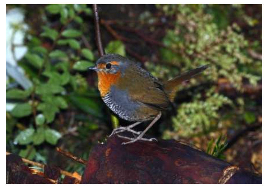
Chucao Tapaculo

A flight to El Calafate takes us to the edge of the Southern Patagonian Ice Field. Charming El Calafate is the gateway to Los Glaciares National Park and the massive Perito Moreno Glacier. A springtime visits to this ever-shifting icy landscape will make an absolutely unforgettable impression on anyone fortunate enough to visit at this delightful season.