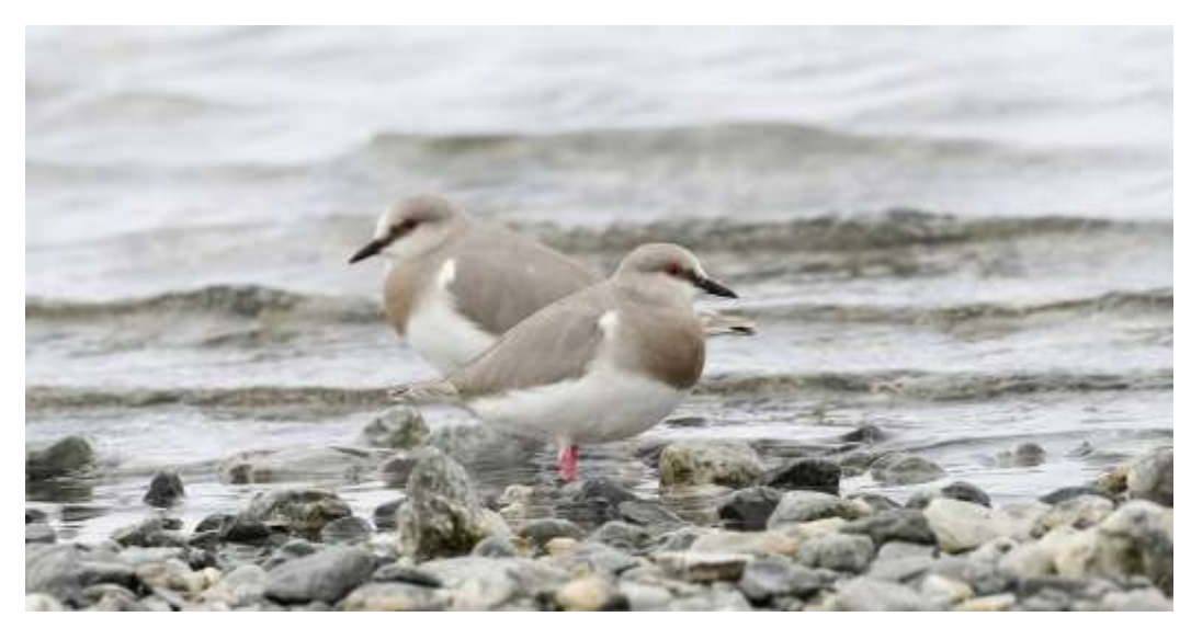
The unique and highly sought-after Magellanic Plover

December 13, Day 12: Morning Birding; Flight to El Calafate and Afternoon at Laguna Nimez. Around mid-day, we'll board a flight to El Calafate, in southern Patagonia. After checking into our hotel, we will pay a visit to a nearby lake, with good chances at seeing Andean and Lake ducks, Red Shoveler, Yellow-billed Pintail, Chiloe Wigeon, one or more coot species, and a variety of gulls and shorebirds. Cinereous Harriers and the stunning Chocolate-vented Tyrant are here, too, and the Austral Negrito is ubiquitous. Our main goal is the highly sought-after and very locally distributed Magellanic Plover. Found only on remote pebble-lined lakeshores, this shorebird is so unusual in so many ways that it is classified in its own family, Pluvianellidae, said to be most closely related to the sheathbills. This bird's curious behavior at time resembles a turnstone's, but then it stomps circles in the mud and pecks at the food it has stirred up. Magellanic Plovers feed their young on crop milk not unlike that secreted by doves.