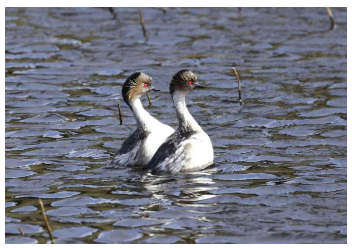
Silvery Grebe

December 16, Day 2: Strobel Plateau Lakes. The Strobel Plateau is a remote area of barren desert dotted with small lakes. It is here that the almost mythical Hooded Grebe survives. We will concentrate our efforts on the lakes that offer the best conditions for finding this spectacular bird. We should be here at the perfect time to witness the grebe's courting display, which is said to be very elaborate. To avoid predation, the grebe nest on floating vegetation and in small colonies, starting in December. The chicks are initially fed small fish, switching to snails about two weeks after hatching.