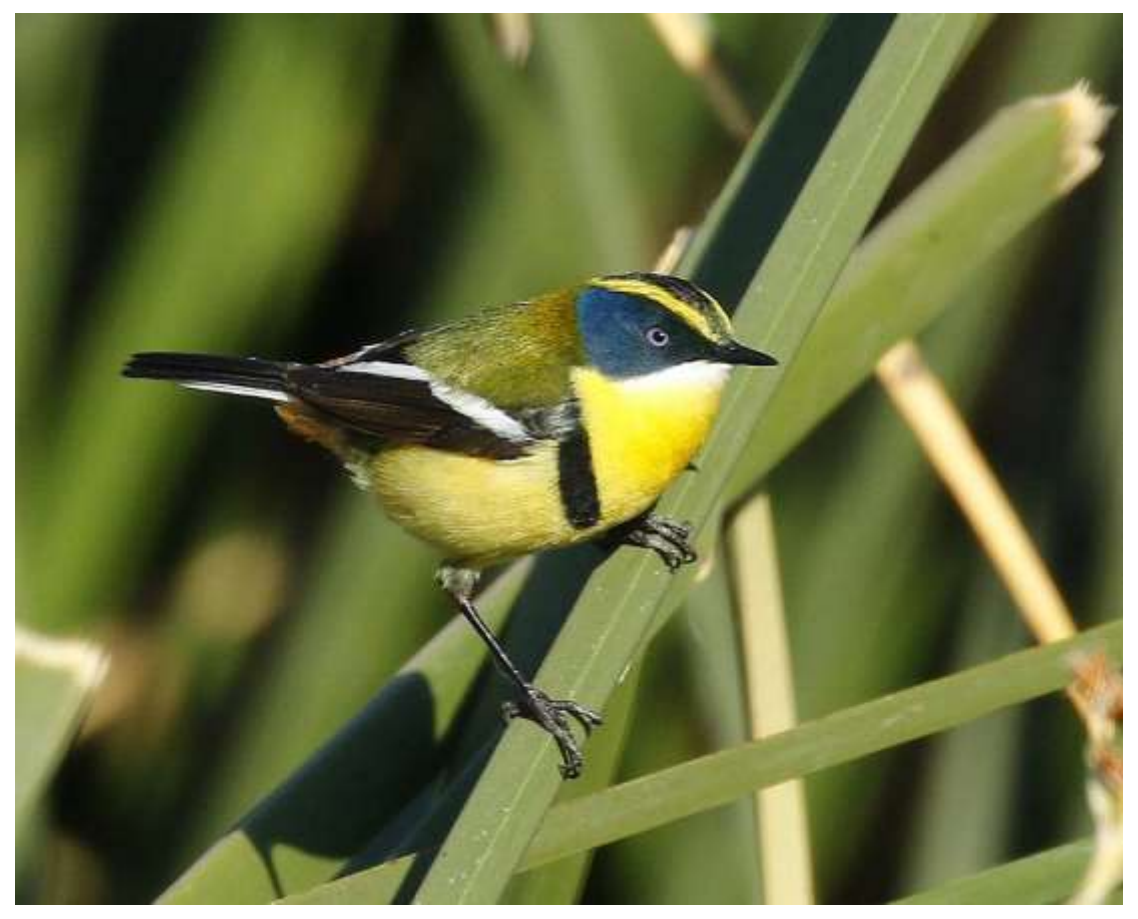
Many-colored Rush Tyrant

We will set out early on the day-long journey from Buenos Aires. Once away from the city, we should begin to see numerous Chimango Caracaras and Snail Kites, and we will keep our eyes open for our first Greater Rheas. Among the waterbirds we hope to see are the Maguari Stork, Coscoroba and Black-necked swans, Speckled and Silver teal, Rosy-billed Pochard, and Yellow-billed Pintail. Occasionally we encounter the graceful Long-winged Harrier. Some less, common species to look for in marshy lagoons and at lake edges are the Silvery Grebe, Black-headed Duck, Gray-headed Gull, Wren-like Rushbird, Firewood-gatherer, Warbling Doradito, and incredible Many-colored Rush Tyrant. Later in the day, we will search for the Brown-and-yellow Marshbird and the spectacular Scarlet-headed Blackbird its head so brightly colored you have to believe to see it. Other species of grassland, wetland, and wooded edge that are possible today include the Spotted Nothura, Checkered Woodpecker, Campo Flicker, Green-barred Woodpecker, Tufted Tit-Spinetail, White-winged Becard, Masked Gnatcatcher, Golden-crowned Warbler, Screaming Cowbird, and the striking White-browed Meadowlark.