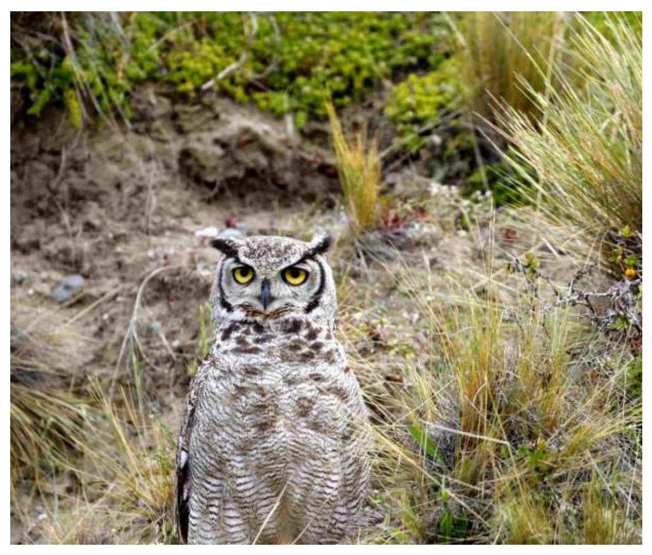
Lesser Horned Owl

EXTRA ARRANGEMENTS: Should you wish to make arrangements to arrive early or extend your stay, please contact the VENT office at least two months prior to your departure date. We can very easily make hotel arrangements and often at our group rate, if we receive your request with enough advance time.