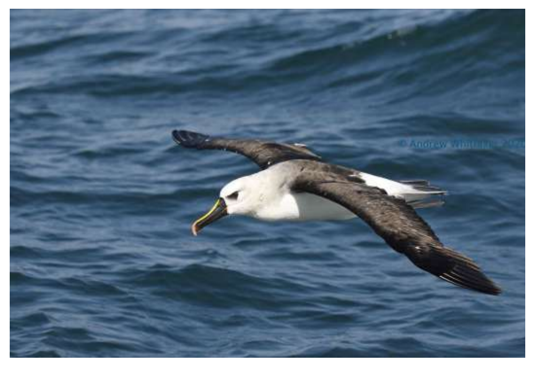
Yellow-nosed Albatross

Our December adventure in southern Argentina begins just south of Buenos Aires, on the famous pampas, home of the gaucho. Once almost treeless, these flat grasslands are now checkered with haciendas and scattered trees. We will concentrate on the wetter, coastal section of the pampas, dotted with marshes teeming with waterfowl and wetland birds. During our two days here, we will visit native hackberry woodlands, mudflats for the nearendemic Olrog's Gull, and wet and dry grasslands for the near-endemic Pampas Pipit. The wide skies and distant horizons recall W. H. Hudson's early descriptions of this fascinating region. The pampas offer one of the continent's most exciting wildlife spectacles, with birds ranging from three-inch hummingbirds to Greater Rheas almost as tall as a human, from exciting ovenbirds and tiny flycatchers to elegant swans and ponderous Southern Screamers. Among the shorebird riches of the area is the exotic and colorful South American Painted-Snipe. We will also take an exciting short morning pelagic trip from Mar Del Plata, where we will visit the nearby subtropical convergence, which attracts a wealth of seabirds