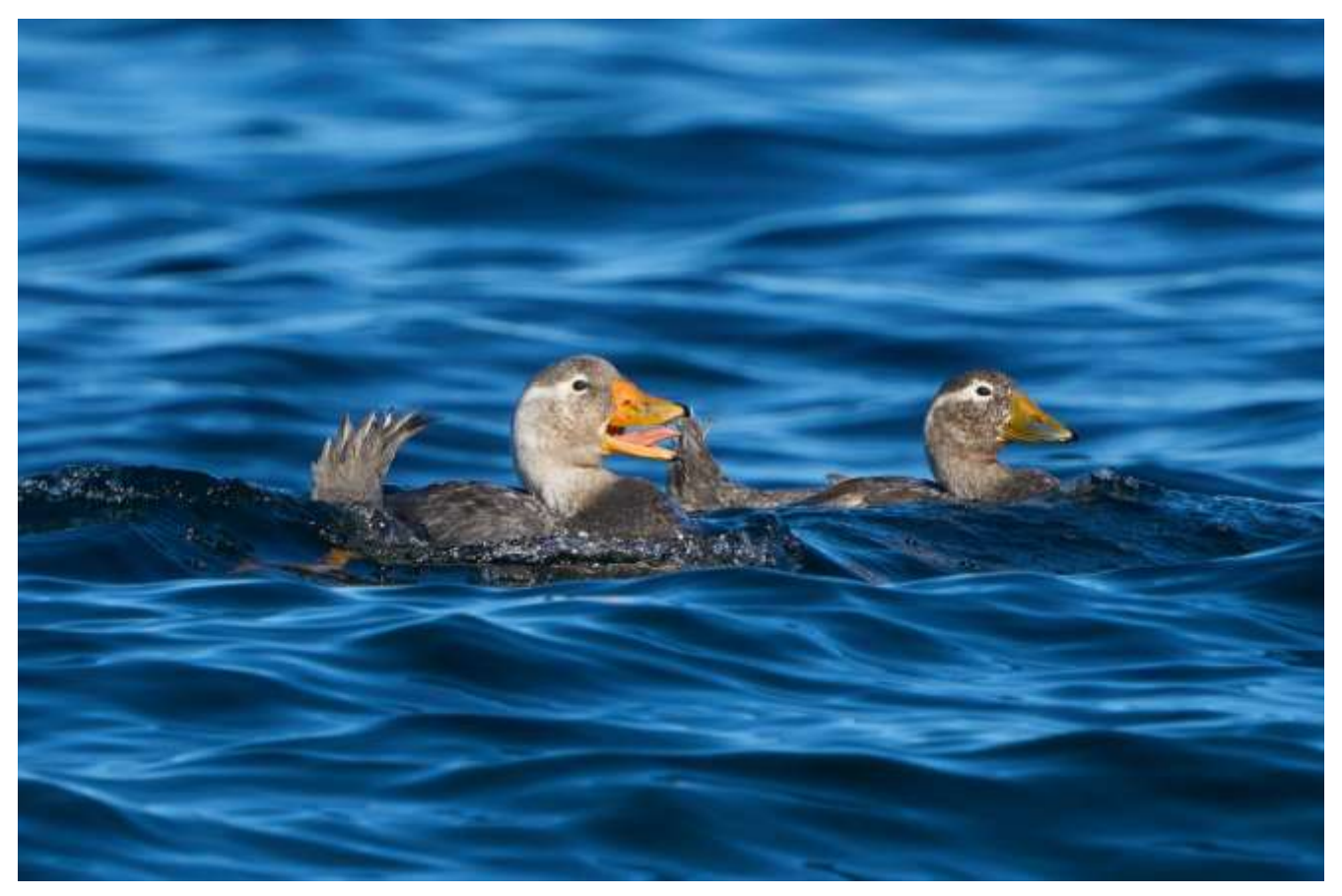
Endemic White-headed Steamer-Duck

Soon after arriving here, we hope to discover our first flocks of rheas mixing with herds of graceful Guanacos. Chilean Skuas patrol the colony, while Elegant Crested-Tinamous and Least Cavies forage in nearby shrubby areas. Other species frequently seen in the colony include Scale-throated Earthcreeper, Long-tailed Meadowlark, Lesser Canastero, and Patagonian Yellow-Finch. Giant-petrels, attractive Rock and Imperial cormorants, Two-banded Plovers, Dolphin Gulls, and South American Terns are often seen at the rugged cliffs at the edge of the colony. There should also be an excellent opportunity to study the endemic White-headed (formerly Chubut) Steamer-Duck, first described as a separate species as late as 1980 and found exclusively on these rocky shores.