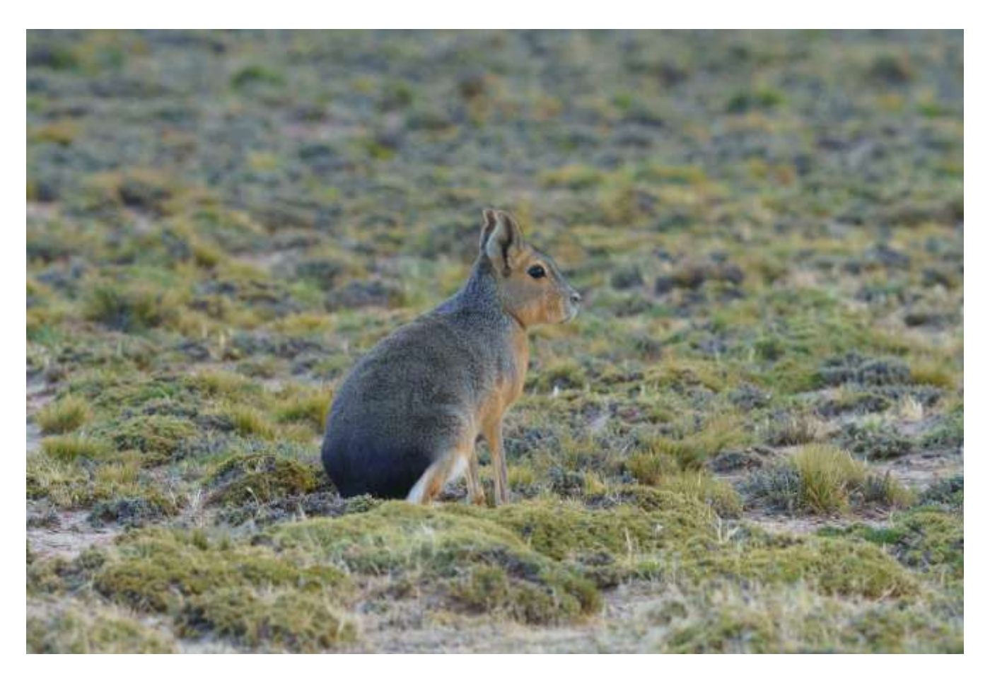
Patagonian Mara

In the northern reaches of Patagonia, we'll visit a scrub desert. At first look, this very special habitat may resemble North America's Chihuahuan desert, but the wildlife couldn't be more different. At Punta Tombo Reserve, we will walk among a colony of a million penguins, and we will search for the Elegant Crested-Tinamou, the endemic White-headed (formerly Chubut) Steamer-Duck, and exotic Burrowing Parakeets. These same areas hold an incredible mix of mammals, including Southern Elephant Seals, camel-like Guanacos, armadillos, cute Patagonian Cavies, and the extremely odd-looking Patagonian Maras, which have been described as looking like "giant rabbits wearing miniskirts."