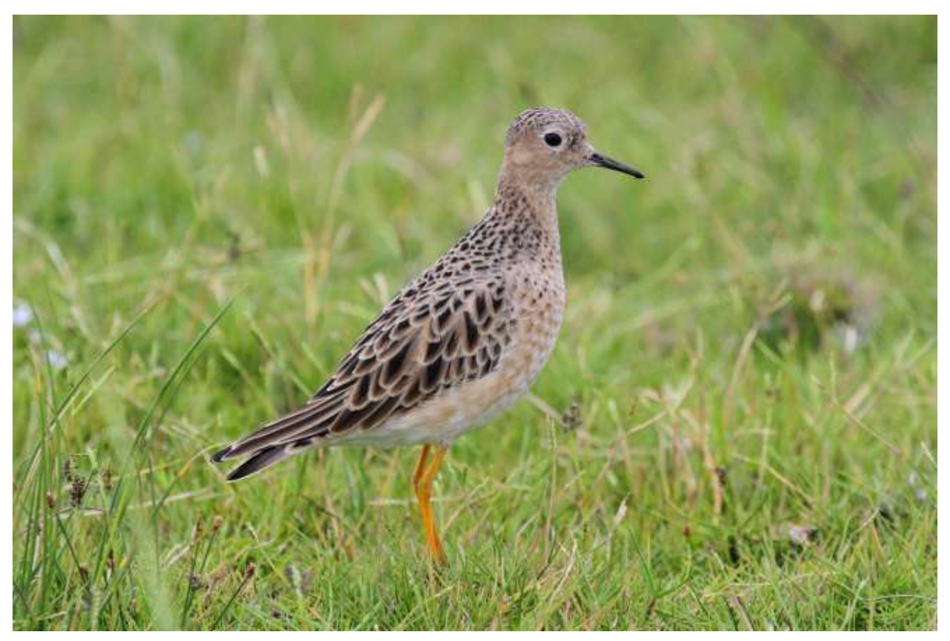
Buff-breasted Sandpipers main wintering area

Weather permitting, we will end the day with a drive across a large estancia in the pampas, where a dirt track winds across open fields, low woodlands, and vast marshes. You'll get a chance to see ranch life up close, experiencing the sights and smells and wide-open vistas that made such a lasting impression on Hudson. You will also get an opportunity to see a sprinkling of the thousands of Buff-breasted Sandpipers and American Golden-Plovers that winter on the grasslands; even Eskimo Curlews once wintered here.