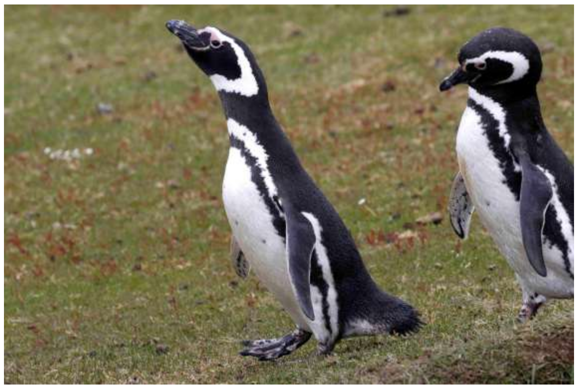
Magellanic Penguins

<u>December 9, Day 8: Punta Tombo Reserve and Trelew.</u> Our destination today will be Punta Tombo Provincial Reserve, on a narrow peninsula about two hours south of the city of Trelew. This is the breeding site of an amazing colony of approximately one million Magellanic Penguins! For obvious reasons, the park service permits access to only a small portion of the colony. Nevertheless, it is an impressive spectacle, and photographic opportunities are superb for both the penguins and the other wildlife in the colony and along the seacoast.