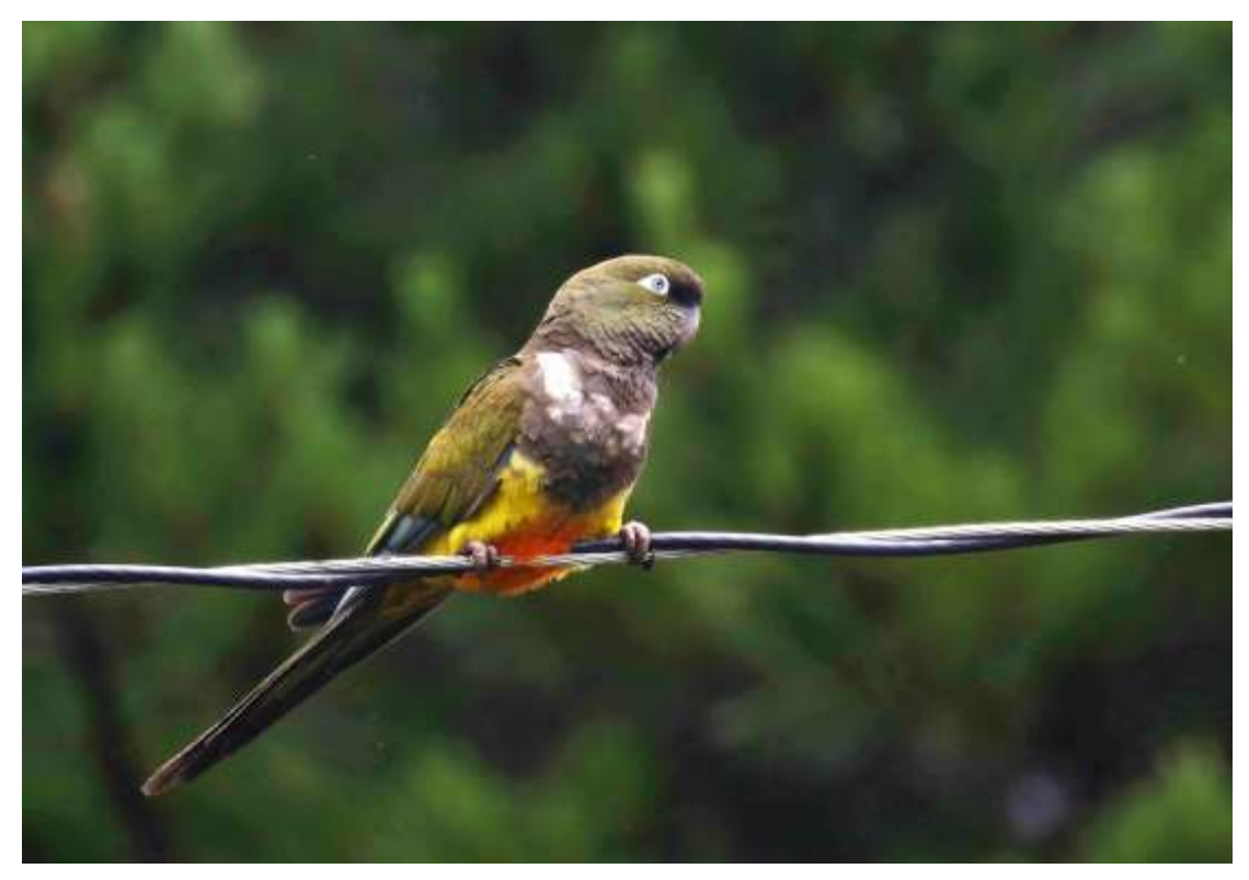
Burrowing Parakeet

NIGHT: Hotel Dazzler by Wyndham, Puerto Madryn