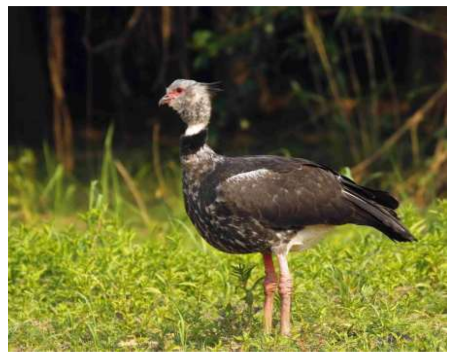
Southern Screamer

December 5, Day 4: Birding the Pampas and Coastal Punta Rasa Natural Reserve. From our comfortable and convenient base in San Clemente, we will explore a tidal estuary, coastal marshland, hackberry and ombu woodland, pampas grassland, and freshwater marshes with sedges and cattails. Among the nearly 100 species we'll be looking for today, a few birds are so characteristic that they seem almost to embody the spirit of the grasslands. Among them are the Southern Screamer, Spectacled Tyrant, Monk Parakeet, and Great Pampas Finch; we will see these birds repeatedly. Today's complete tally may include almost all of the species we saw yesterday, along with Great Grebe, Spotted Nothura, South American Painted-Snipe (irregular and unpredictable), Aplomado Falcon, White-throated Hummingbird (rare and mainly around San Clemente), Bay-capped Wren-Spinetail, the uncommon Hudson's Canastero, Long-tailed Reed Finch, and Pampas, Correndera, and Short-billed pipits. Later in the morning, we'll check the beaches for Chilean Flamingos, shorebirds (especially wintering Hudsonian Godwits), and delightful Snowy-crowned Terns. We will of course focus especially on the rare, near-endemic Dot-winged Crake (a skulker) and crab loving critically endangered Olrog's Gull. Almost all of the world's population 5-8000 pairs breed here in the southern Buenos Aires Province!