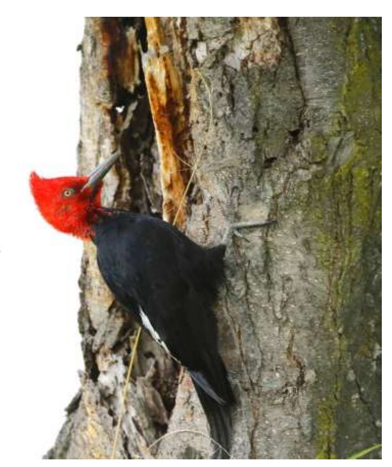
Male Magellanic Woodpecker