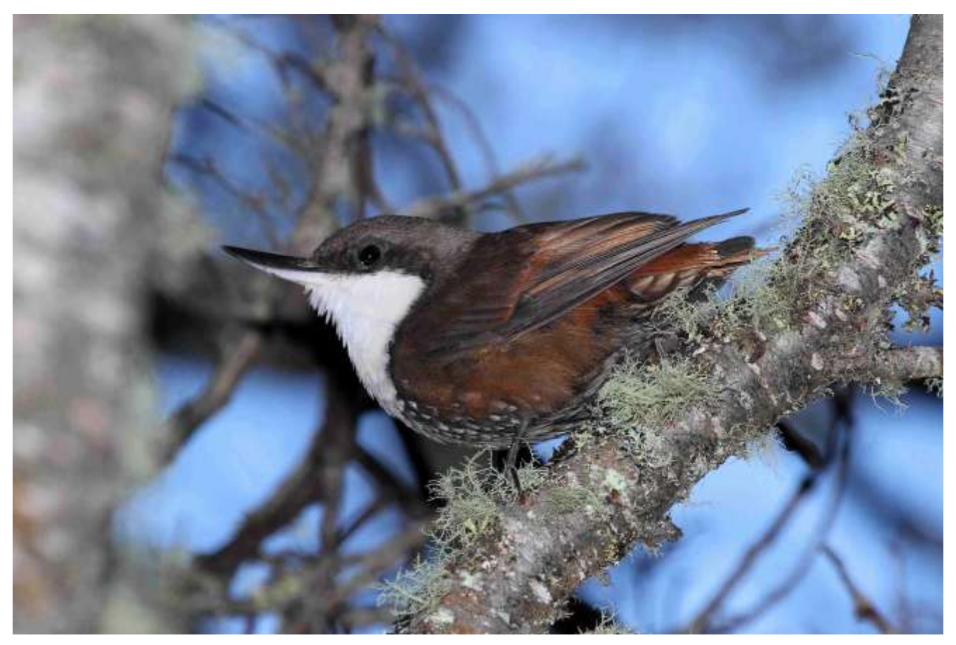
White-throated Treerunner

Around midday, as thermals begin to rise, we have a chance at such interesting birds of prey as the uncommon and range-restricted White-throated Hawk. After a delicious lunch, we will return to our hotel for a rest, then go out later in the afternoon to further explore the scenic area around the hotel.