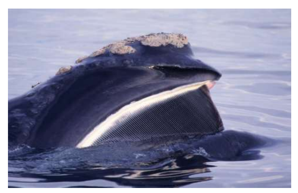
Southern Right Whale

<u>December 9, Day 8: Punta Tombo Reserve and Trelew.</u> Our destination today will be Punta Tombo Provincial Reserve, on a narrow peninsula about two hours south of the city of Trelew. This is the breeding site of an amazing colony of approximately one million Magellanic Penguins! For obvious reasons, the park service permits access to only a small portion of the colony. Nevertheless, it is an impressive spectacle, and photographic opportunities are superb for both the penguins and the other wildlife in the colony and along the seacoast.