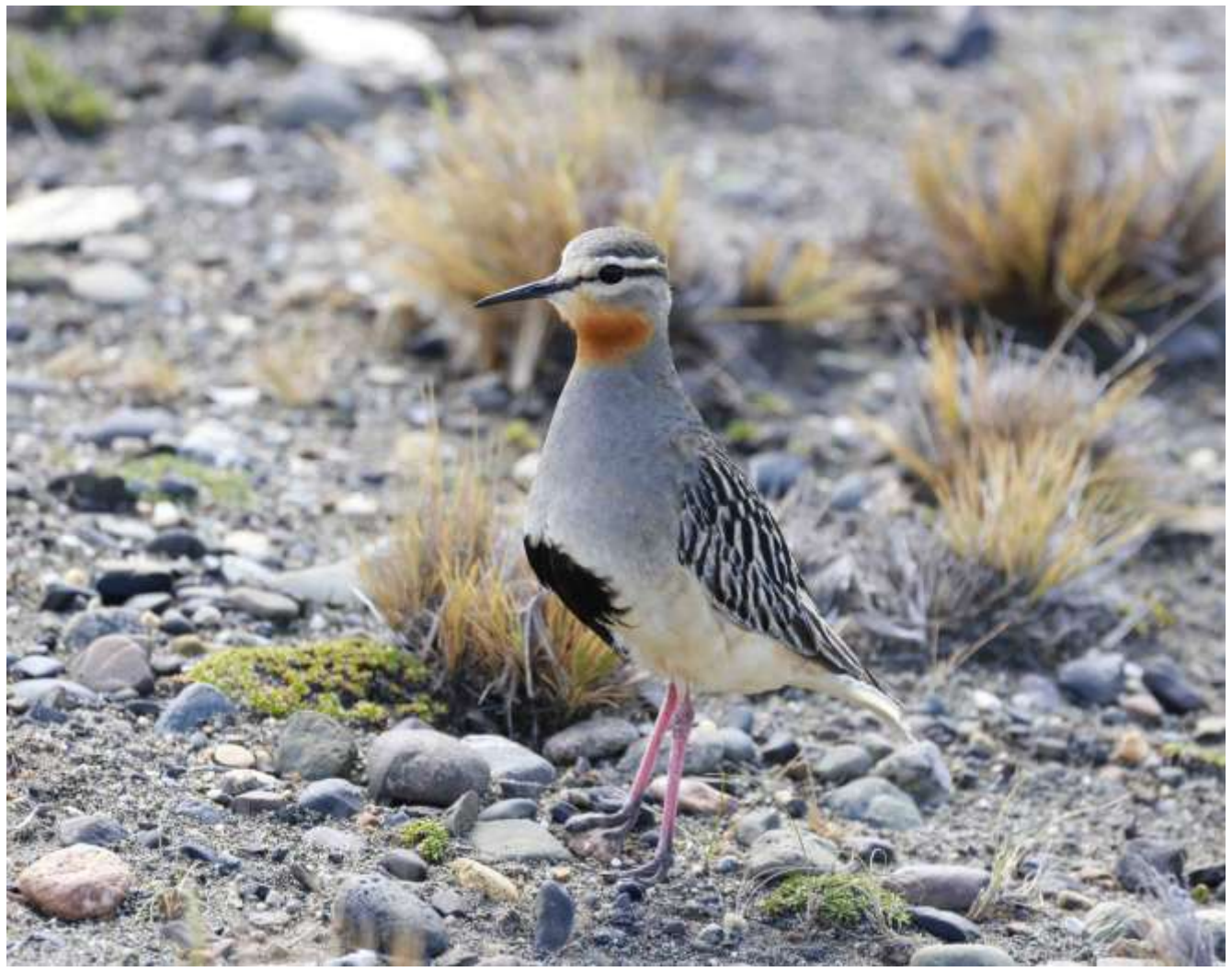
Tawny-throated Dotterel

Our next exciting destination, reached by a short flight, is the famous Bariloche region of northwestern Patagonia. Here we are welcomed by some of the grandest terrain anywhere on the continent. Snowcapped mountains tower over vast glacial lakes and forests in this area famous for its skiing and delightful alpine-style architecture. Here and on the high plains and in southern beech forests, the air is cool and many of the birds are endemic, found nowhere else but these forests and plains. The plethora of exciting birds we hope to enjoy here includes the Magellanic Woodpecker, White-sided Hillstar, Rufous-legged Owl, Chucao Tapaculo, Black-throated Huet-huet, and several ground-tyrants. This beautiful region is also home to the Andean Condor, the lovely Rufous-tailed Plantcutter, and the hardy White-throated Treerunner.